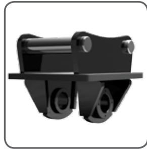
Double Fixed Pin