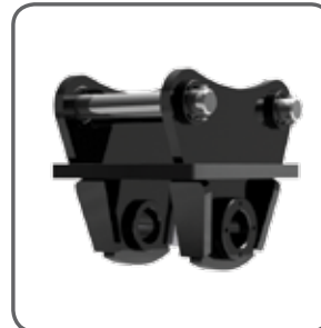
Double Loose Pin